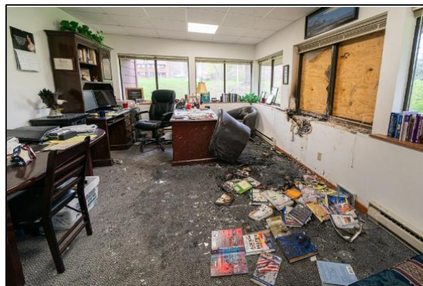
Arson at pro-life facility in OR

(U//NP) Prior to the release of SCOTUS's final decision in Dobbs v. Jackson Women's Health Organization , a draft opinion was leaked in May. A group called Jane's Revenge claimed responsibility for several arsons and vandalisms at pro-choice facilities across the country. The group called the attacks a warning and vowed to continue the use of "increasingly extreme tactics" with no further warnings.