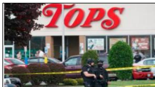
Tops Friendly Market

(U//NP) On 14 May 2022, 18-year-old Peyton Gendron shot and killed 10 people and injured three others in a racially motivated attack at a supermarket in Buffalo, New York that was live streamed on Twitch. Prior to the attack, the suspect authored a white supremacy manifesto and is believed to have selected a predominantly black area for his attack that was planned for months. Gendron has been charged with 10 counts of first-degree murder, 10 counts of second-degree murder as a hate crime, and three counts of attempted murder as a hate crime.