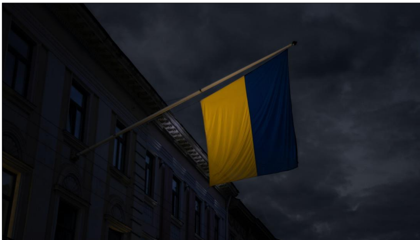
Figure 4 - Source: Recorded Future

(U//NP) At the start of Russia's war against Ukraine in February, many information security and intelligence experts predicted Russia would launch a campaign of cyberattacks against not only Ukraine, but other nation states and entities the Russian Government perceived as hostile to its interests. While according to Ukraine's top cybersecurity official Russian backed groups have launched nearly 800 cyberattacks against Ukraine at a high operational tempo (three times more than the same period last year), few attacks have caused the significant economic damage that Western intelligence officials feared, either to Ukraine or against the U.S. and NATO allies. Most cyberattacks appear to have had little more than a psychological effect.