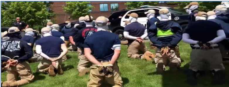
Patriot Front Members arrested in Idaho