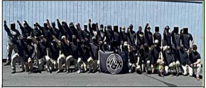
NCS-131 in Boston, July 2022

(U//NP) The MBHSR continues to see WRMVE-inspired groups active in the area. Local activity includes continued propaganda dissemination and recruitment efforts along with Patriot Front and Nationalist Social Club (NSC-131) members holding events in the region. Both groups appear to have grown in numbers over the past quarter and have attracted members from out of state to participate in events in the MBHSR. A recent photo (featured right) posted by NSC-131 shows a group about double the size as in previous pictures.