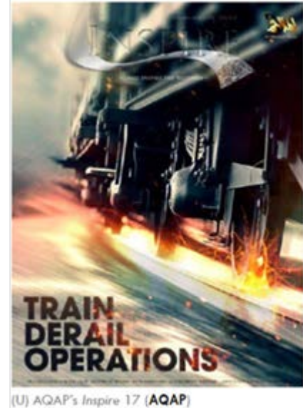
(U) AQAP's Inspire 17 (AQAP)

(U) INDICATORS OF TERRORIST/CRIMINAL ACTIVITY: A totality of behavioral indicators and other relevant circumstances should be evaluated when considering law enforcement notification and response. If determined that conduct or behavior is, in fact, suspicious, law enforcement professionals should further examine the circumstances. No single indicator should be the sole basis for law enforcement action. 2