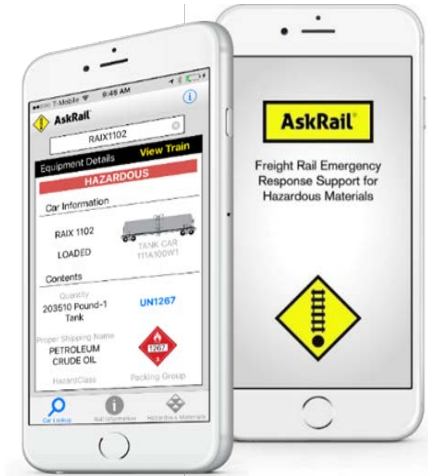
(U) The AskRail® Application

(U) AskRail® : This application is a safety tool that provides first responders immediate access to accurate, timely data about what type of hazardous materials a railcar is carrying so they can make an informed decision about how to respond to a rail emergency. AskRail® is a backup resource if information from the train conductor or train consist is not available. 4