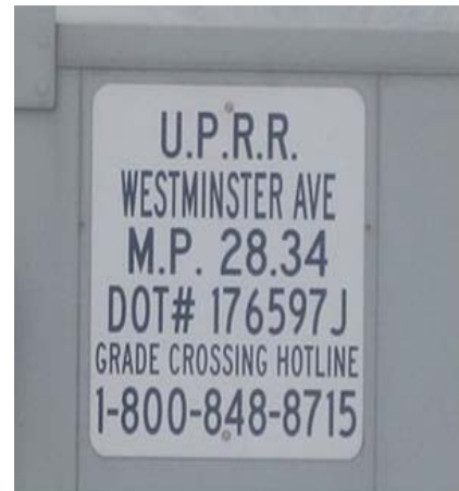
(U) Grade Crossing Signage